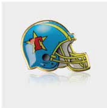
NON STOCK PINS