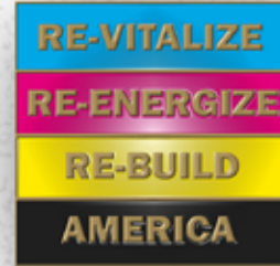
KU-DP-002-RC 1" square