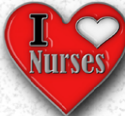
KU-DP-015-RC 1" heart