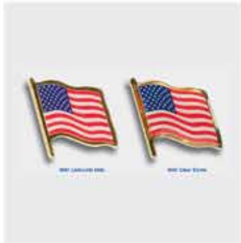
AMERICAN FLAG PINS