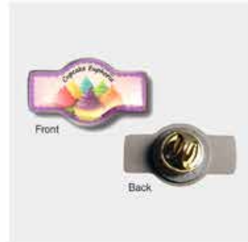
CUSTOM CONTOUR PINS