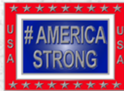
KU-DP-009-RC 3/4" x 1" rectangle